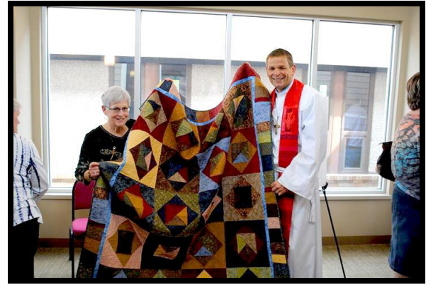
QUILTS FOR MINISTRY